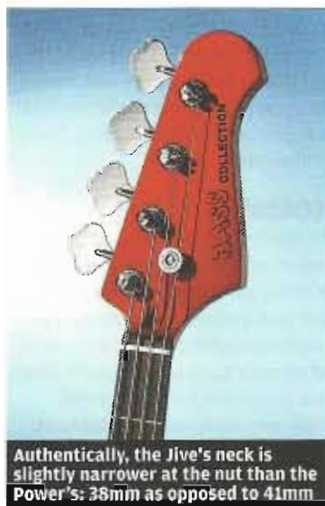
Authentically, the Jive's neck is slightly narrower at the nut than the Power's: 38mm as opposed to 41mm

The Jive gives a superb reproduction of the Jazz sound with glittering highs, punch and crunchiness in the low end