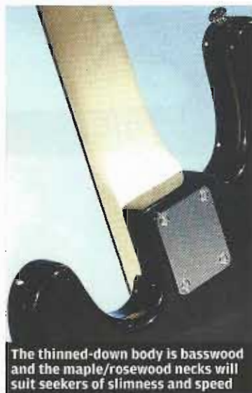
The thinned-down body is basswood and the maple/rosewood necks will suit seekers of slimness and speed