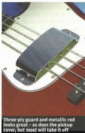
Three-ply guard and metallic red looks great – as does the pickup cover, but most will take it off

The shape hasn't changed – it's still the familiar offset design of 1960 – but, crucially, the Jive is a less weighty instrument than it used to be because 4mm has been shaved off the body, making it 39mm deep as opposed to 43mm. Both forearm and ribcage chamfers are present and correct. The expertly-applied king crimson finish is close to Fender's candy apple