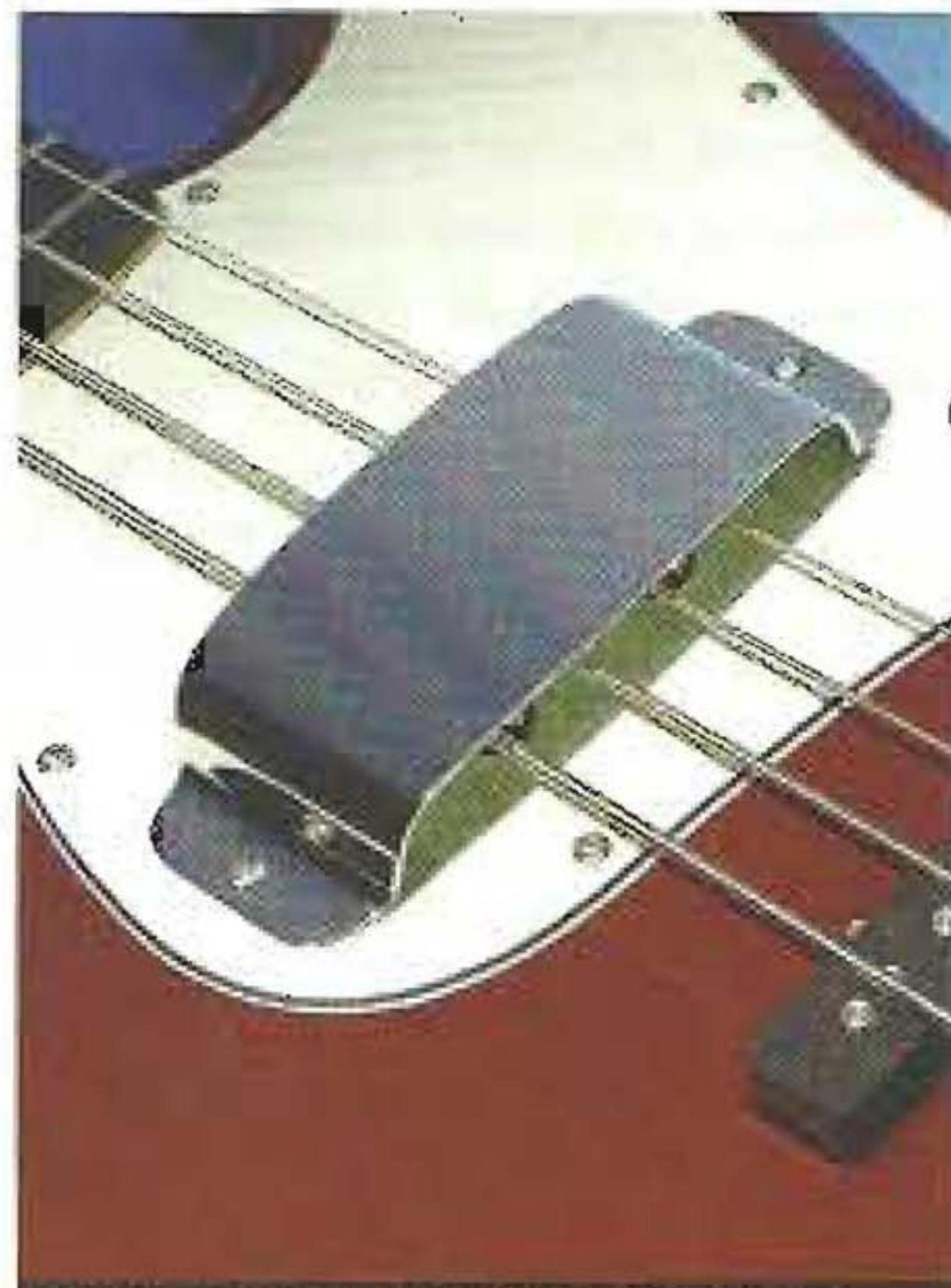
Three-ply guard and metallic red looks great – as does the pickup cover, but most will take it off

The shape hasn't changed – it's still the familiar offset design of 1960 – but, crucially, the Jive is a less weighty instrument than it used to be because 4mm has been shaved off the body, making it 39mm deep as opposed to 43mm. Both forearm and ribcage chamfers are present and correct. The expertly-applied king crimson finish is close to Fender's candy apple