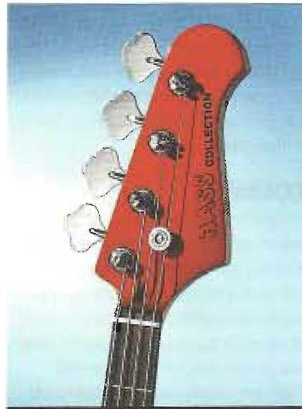
Authentically, the Jive's neck is slightly narrower at the nut than the Power's: 38mm as opposed to 41mm

The Jive gives a superb reproduction of the Jazz sound with glittering highs, punch and crunchiness in the low end